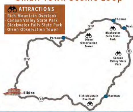
Estimated tour time: 8 hours, 21 minutes- 383 miles