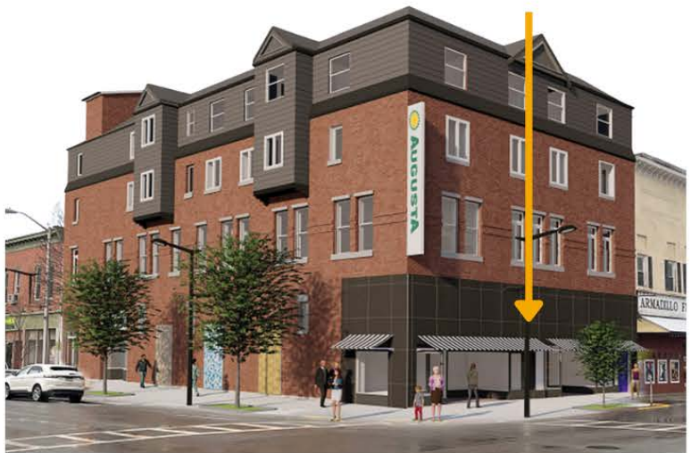
rendered image of Wilt Building with updates